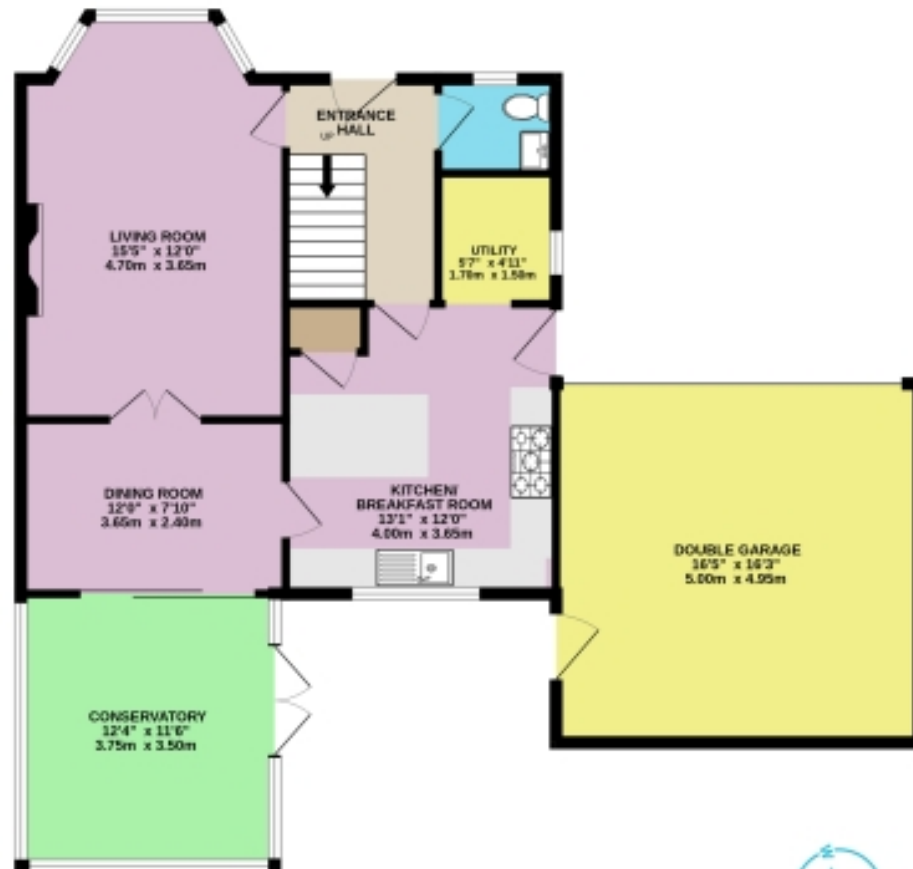
GROUND FLOOR 990 sq.ft. (92.0 sq.m.) approx.